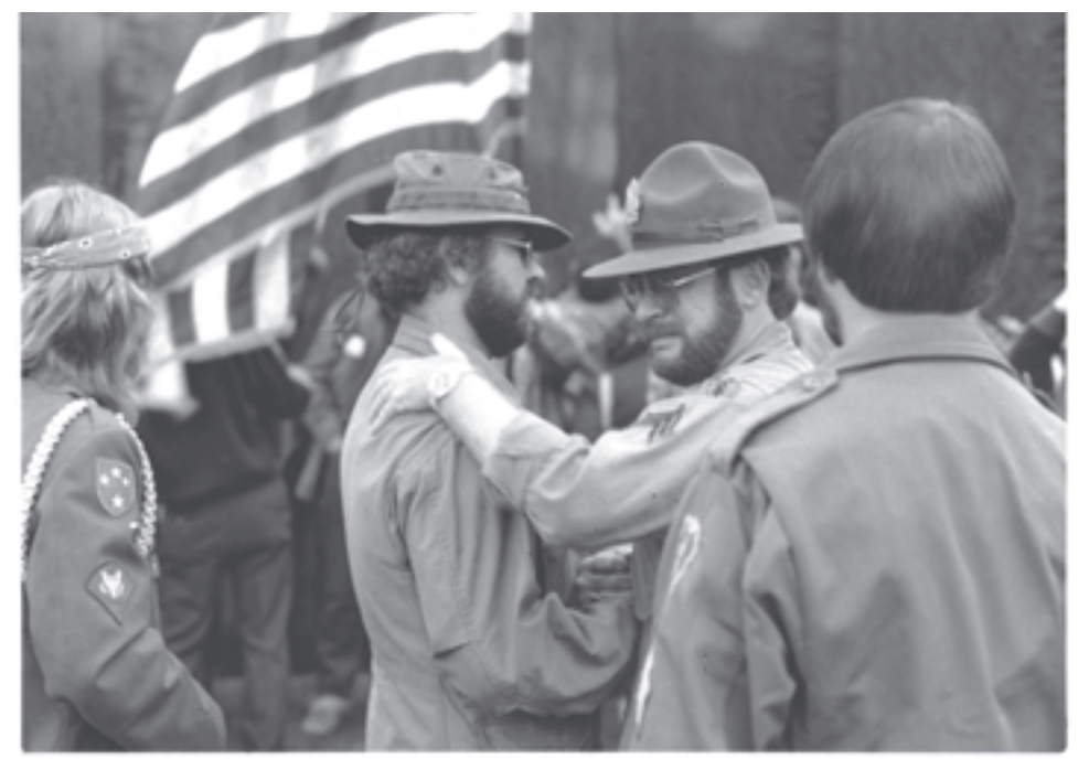
This scene caught my eye immediately, and still demands strong emotional response. It appears that these two were comrades in Vietnam and just became reacquainted at the Wall.

dedication. I found an open area near the monument set aside for Gold Star families.